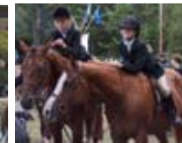
Are we having fun yet??