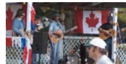
Keeping the mood light