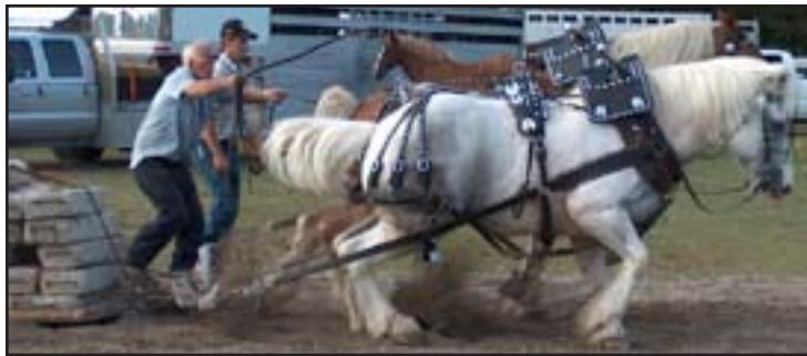
won by a nose