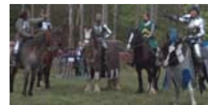
Men of Valour