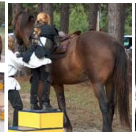
biggest horse I've ever seen