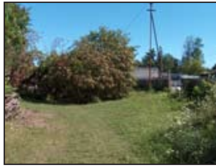
almost a head start on the C.C. demolition