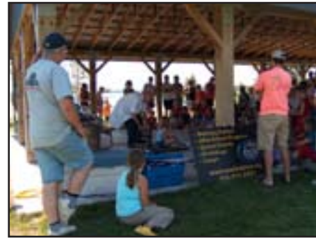
Mad Scientist Dazzles the Crowd