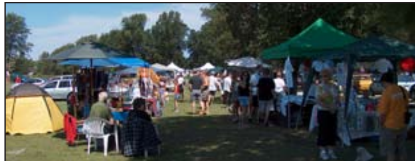
Value and Variety in Vendors Alley