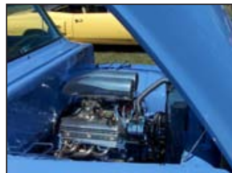
Motors make the Machine