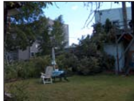
a backyard bar bq ruined