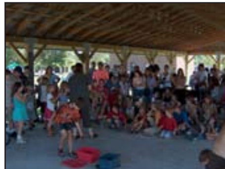
Kid's Petting Zoo