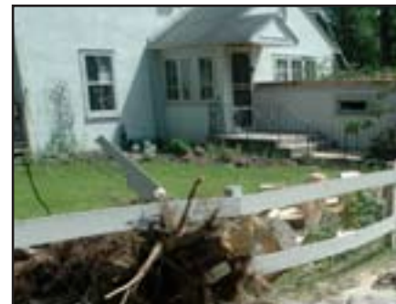
pavement and all