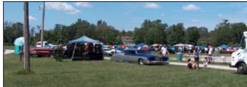
LO EH Heads up a Great Show