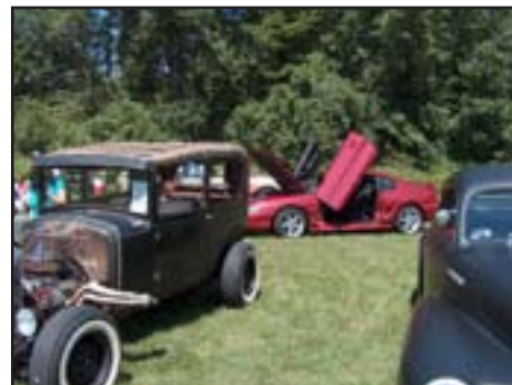
Variety is the Spice