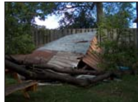
good bye tool shed